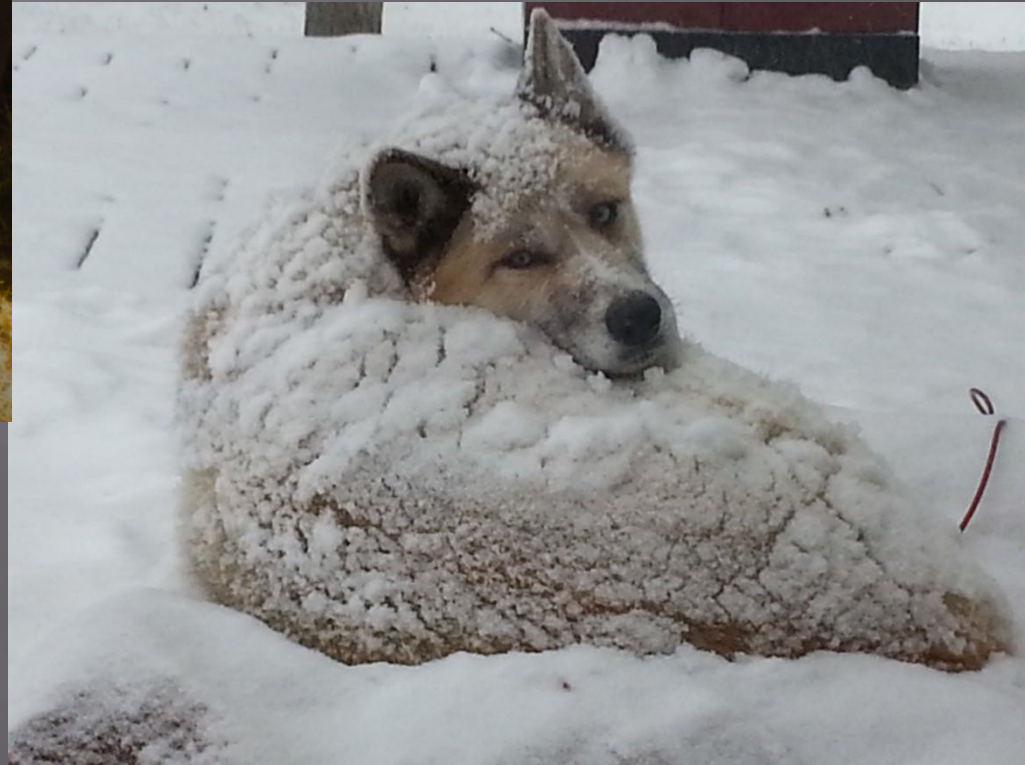
Kaiya the run away artist