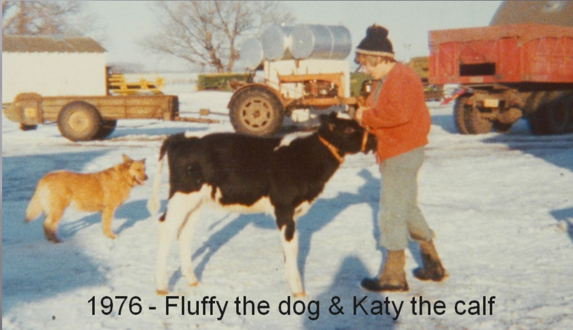
1976 - Fluffy the dog & Katy the calf